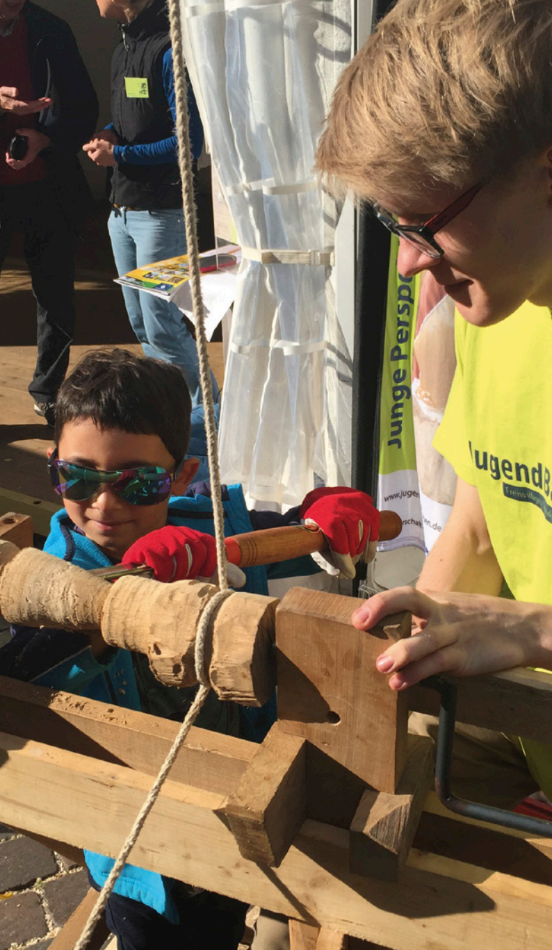
Even the youngest are interested in the work of the Jugendbauhütten